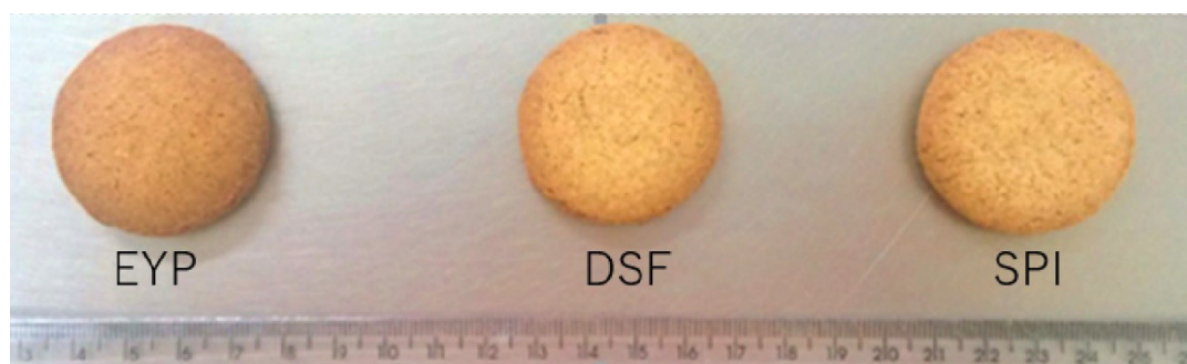
Figure 3. The visual appearance of cookies made with egg yolk powder (EYP), de-oiled sunflower meal (DSF) and sunflower protein isolate (SPI).

a,b,c Values in columns followed by the same letter are not significantly different ( p > 0.05 ) according to Tukey's post-hoc test. L*, a*, b* = color parameters.